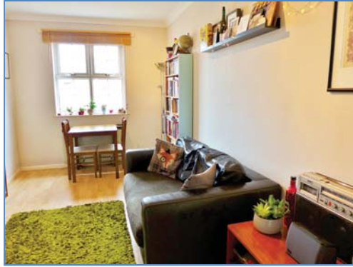
Lounge Aspect One