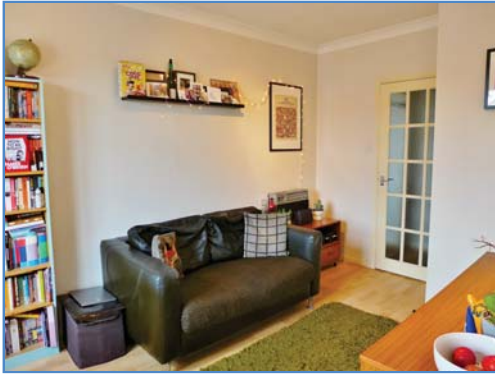
Lounge Aspect Two