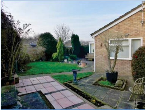
Private Enclosed Garden

Priors Road, Whittlesey, Peterborough, PE7 1LQ.