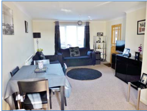
Lounge/ Diner Aspect 1