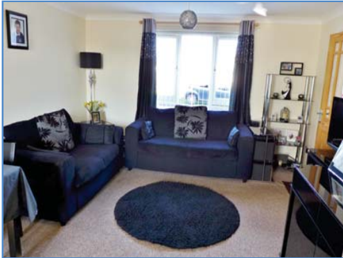
Lounge / Diner Aspect 2