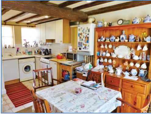
Kitchen/ Diner Aspect 1

Reubens Yard, Whittlesey, Peterborough, PE7 1HP.