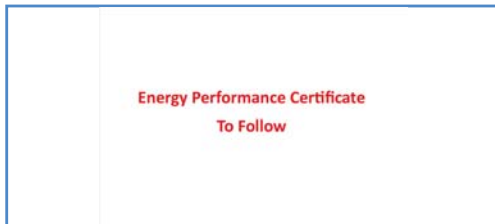
Energy Performance Certificate

Draft details only may be subject to amendment None of the statements/measurements in these particulars should be relied on as representations of fact. Any applications/services mentioned should not be taken as a guarantee that they are in working order.