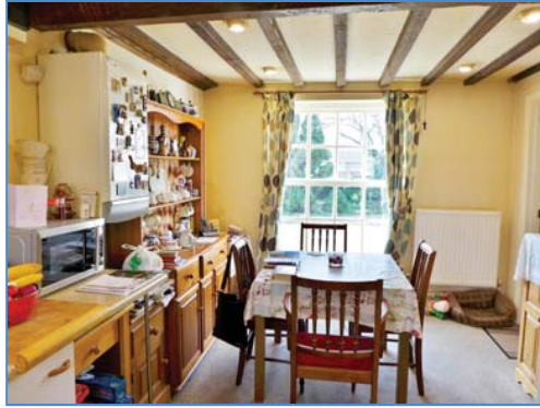
Kitchen/Diner Aspect 2