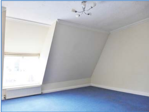
Lounge Aspect 2