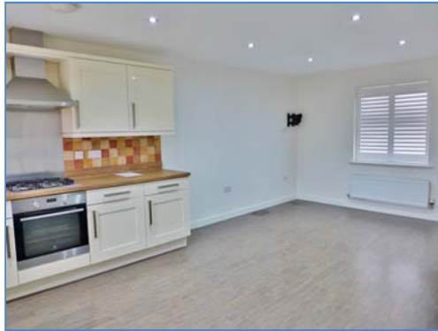
Kitchen/Diner Aspect 2