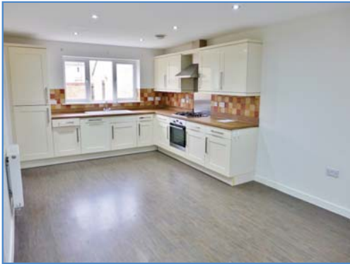
Kitchen/ Diner Aspect 1

Flora Close, Cardea, Peterborough, PE2 8GY.