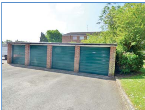
Garage & Off Road Parking