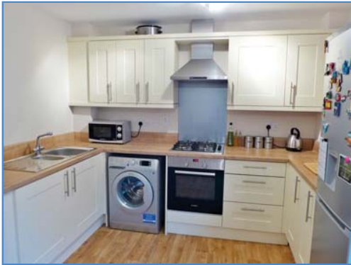
Kitchen/Diner Aspect 1

Bruce Grove, Hempsted, Peterborough, PE7 0NL.