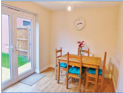
Kitchen/Diner Aspect 2