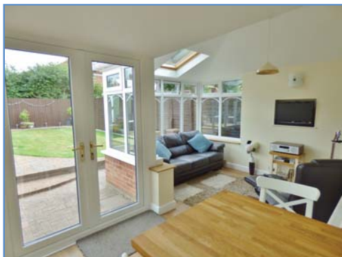
Conservatory/Warm Roof Conversion