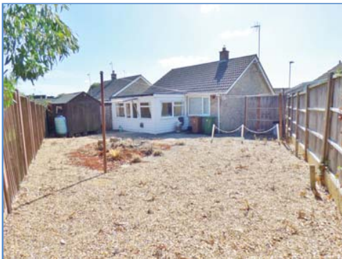
Low Maintenance Garden