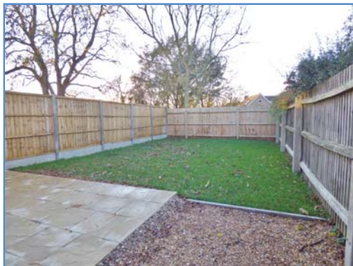
Enclosed Rear Garden