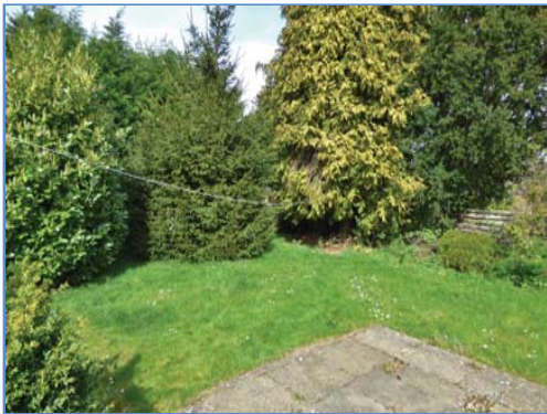
Rear Aspect Two