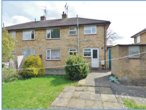
Rear Aspect One