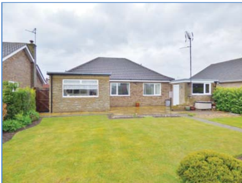
Enclosed Rear Garden