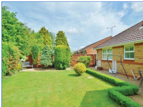
Rear Garden Aspect 2