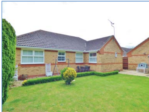
Rear Garden Aspect 1