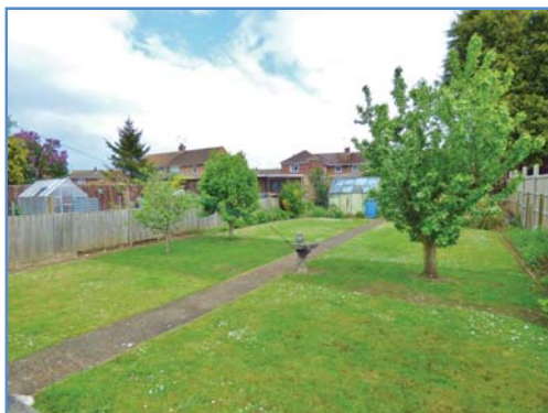
Enclosed Rear Garden