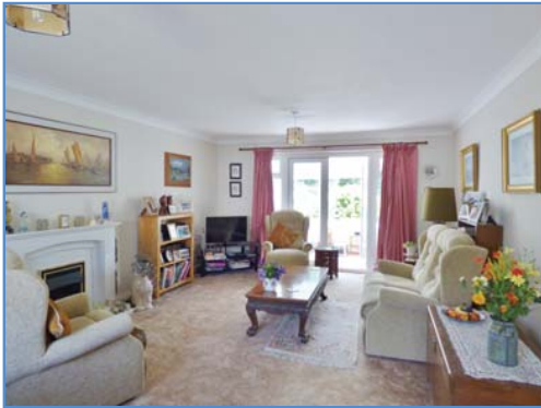
Lounge/Diner Aspect 1

Exeter Drive, Spalding, Lincolnshire, PE11 2DY.