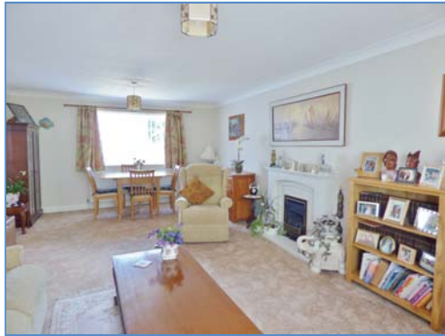
Lounge/Diner Aspect 2