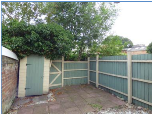
Low Maintenance Rear Garden