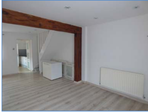
Lounge/Diner Aspect 2