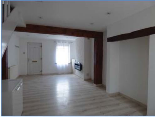
Lounge/Diner Aspect 1

Gore Lane, Spalding, Lincolnshire, PE11 1BN.