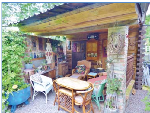
Outdoor Seating Area