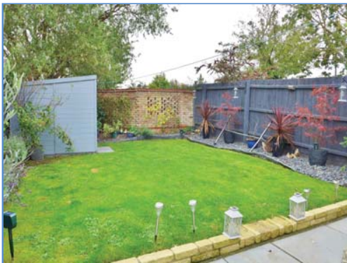
Enclosed Rear Garden