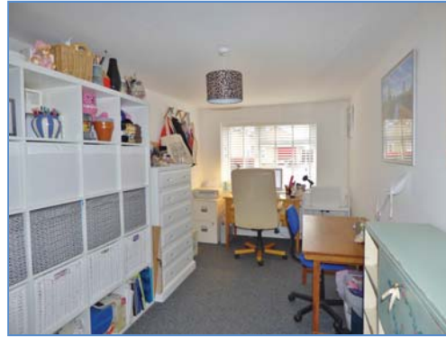
Bedroom Two/ Craft Room