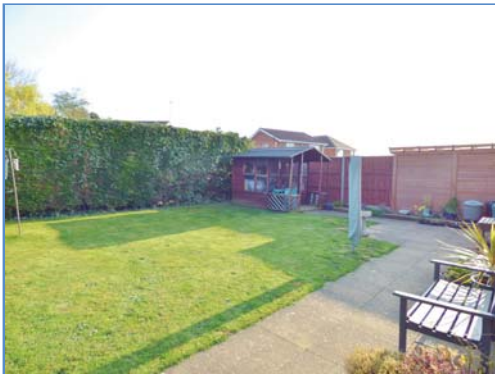
Enclosed Rear Garden