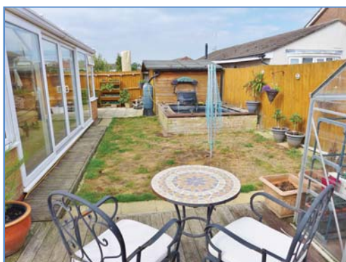
Enclosed Rear Garden