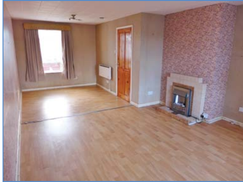
Lounge/Diner Aspect 1