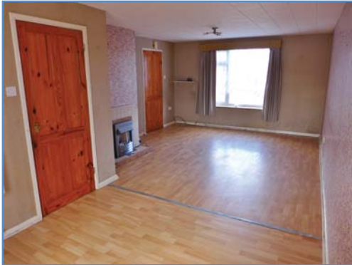
Lounge/Diner Aspect 2