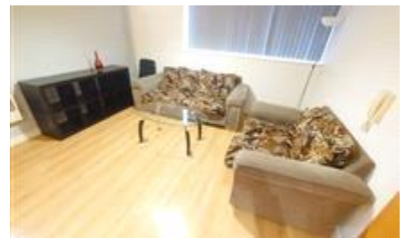
City View Apartments, Everton £600 pcm