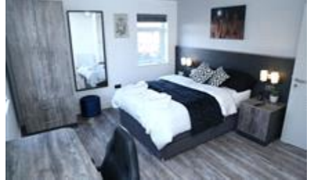
Kensington, Kensington £135 pw