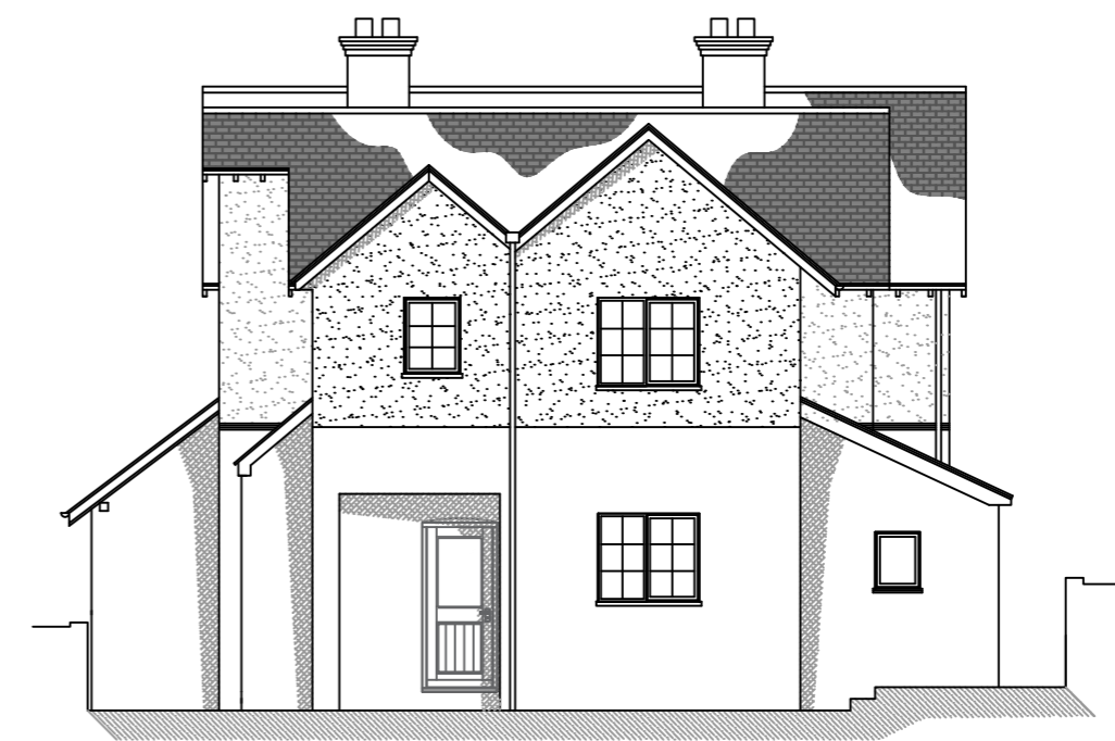
PROPOSED SIDE ELEVATION FACING NORTH (FOR CLARIFICATION PURPOSES, RETAINING GARDEN WALL NOT SHOWN)

NOTES: DO NOT SCALE FROM DRAWINGS EXCEPT FOR PLANNING PURPOSES REPORT ALL ERRORS OMISSIONS AND DISCREPANCIES TO ENGLISH HERITAGE BUILDINGS. ALL DIMENSIONS TO BE CHECKED AND VERIFIED ON SITE BEFORE COMMENCING ANY WORK.