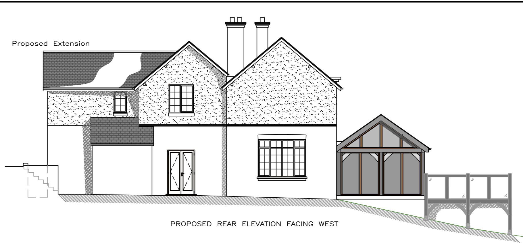
PROPOSED REAR ELEVATION FACING WEST