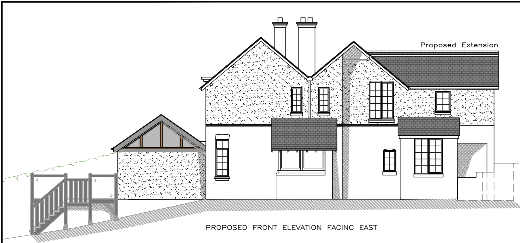
PROPOSED FRONT ELEVATION FACING EAST