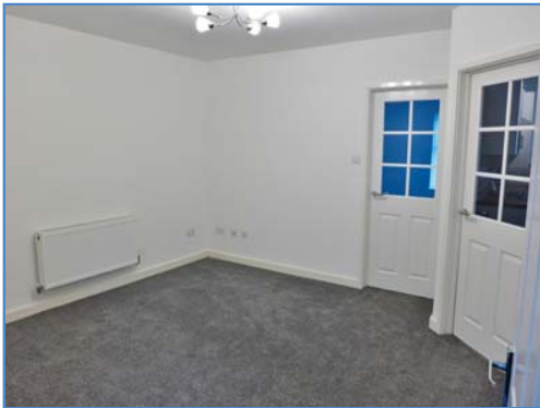
Lounge Aspect 1