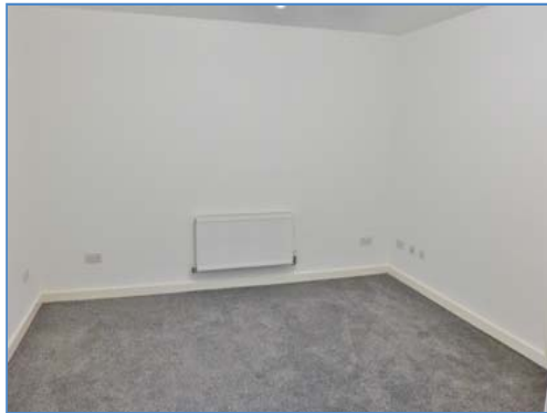
Lounge Aspect 2